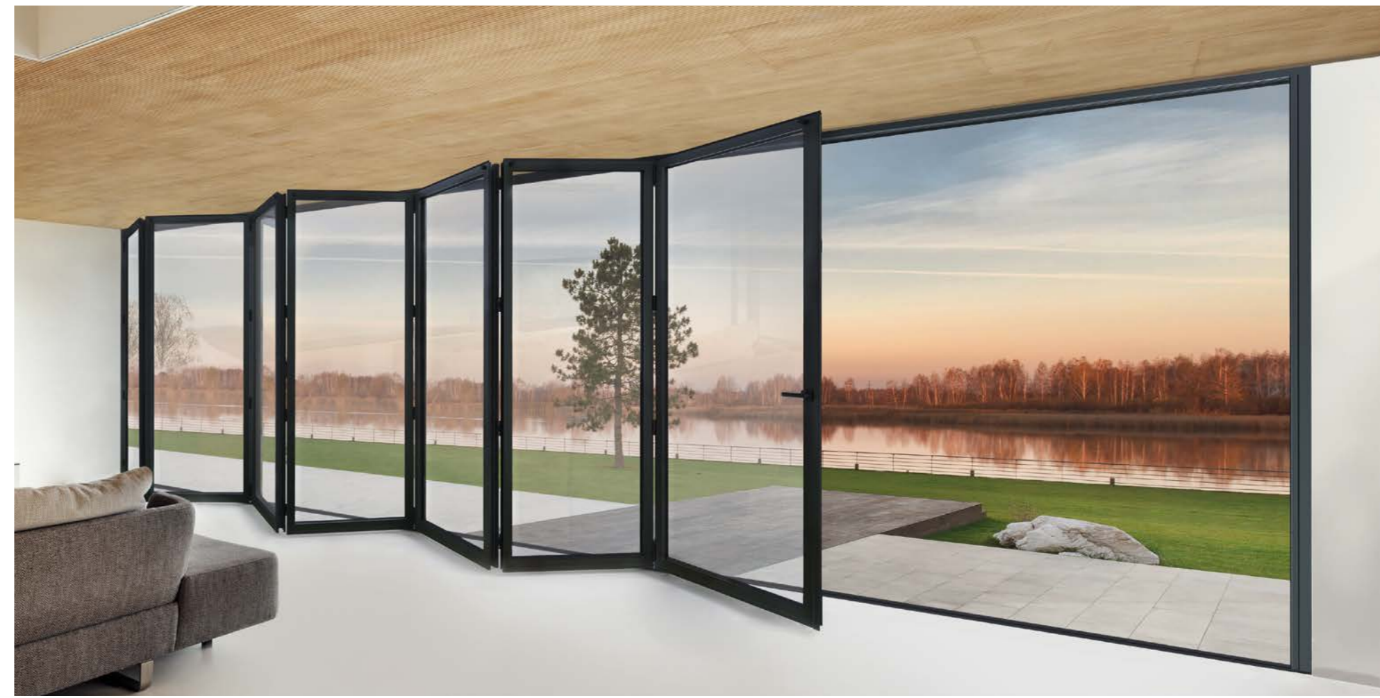
BI - FOLD